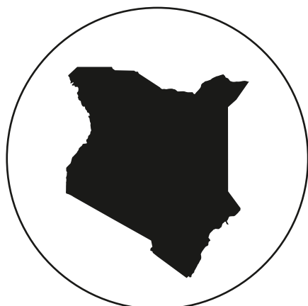
Table 1: Kenya Country Data