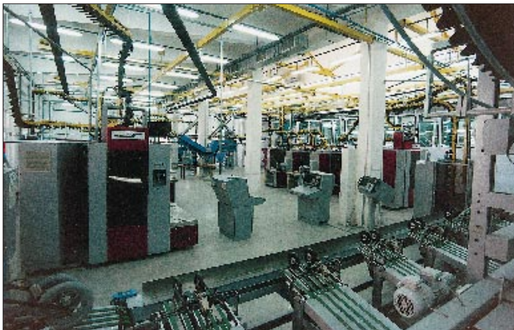
A view of the new mailroom at 168 hours in Sofia.

for very small bundles that are not suitable for strapping. The finished bundles are then transported to the compatibly designed loading ramp for delivery trucks and vans.