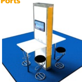
Furnishing and colours depending on Media Port